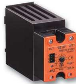
Solid state contactor PH 9270